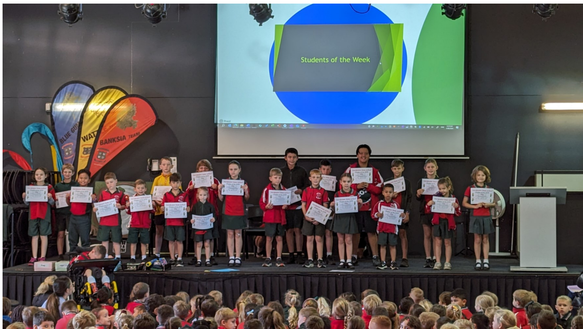
STUDENTS OF THE WEEK 03/06/2024