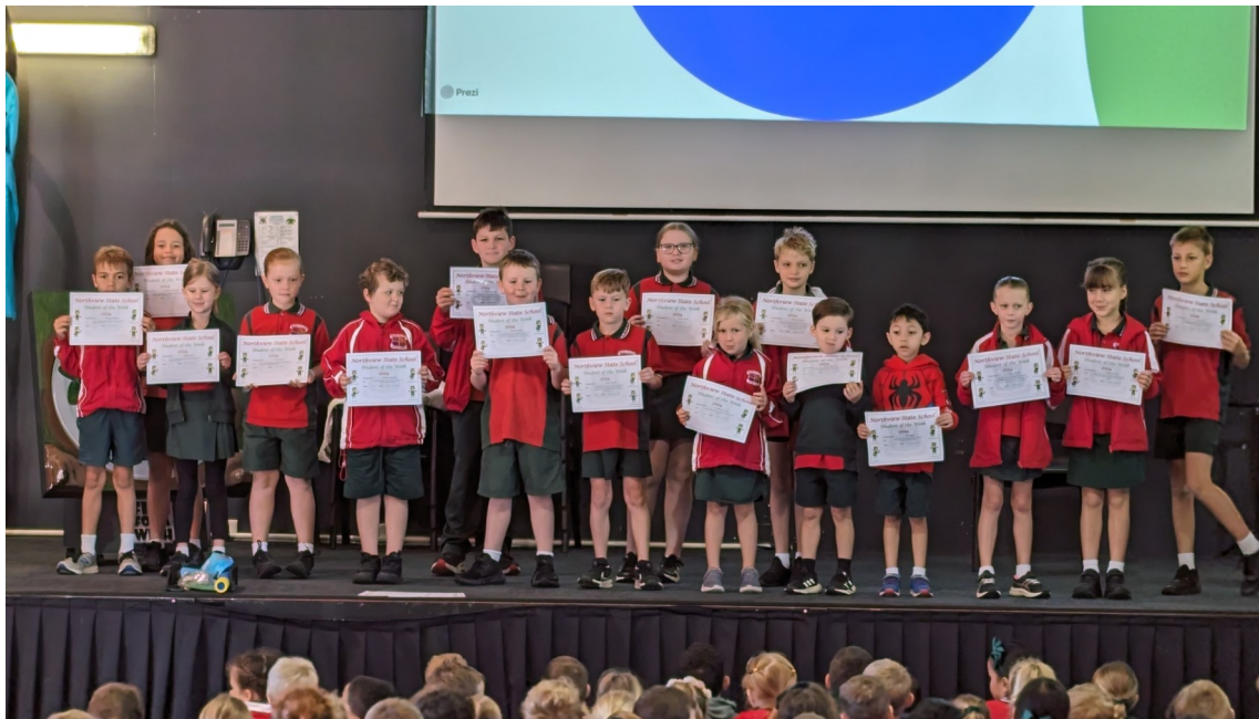
STUDENTS OF THE WEEK 10/06/2024